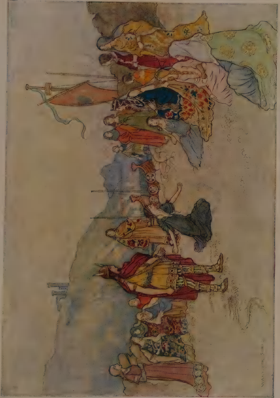
THE KNIGHT AND THE OLD WOMAN AT THE COURT